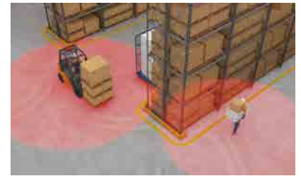
Vehicle to Pedestrian

Fleet Aware's application can include any of the following:-