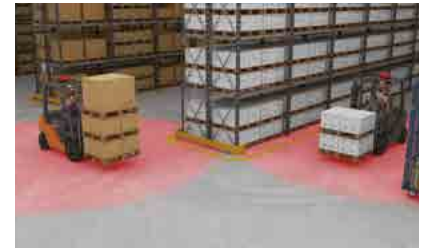
Vehicle to Vehicle